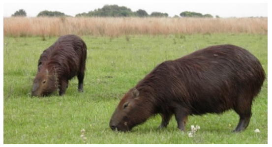
Figure 1. The way of foraging of capybaras exposes them to the ingestion of parasite eggs or larvae, especially when there is food shortage, as they need to graze closer to the ground, where parasite propagule density is highest. (Photo credit: Ayelen T. Eberhardt).