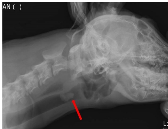
Figure 1. Radiographic view (lateral) of the foreign body (red arrow) in the trachea of a Kangal dog.

Lateral radiography of the neck region revealed a radiopaque foreign body 3-4 cm in diameter within the trachea in the caudalis of the larynx (Figure 1). It was decided to perform an endoscopic examination in order to understand exactly what the foreign body was and to determine its accessibility from the oral cavity.