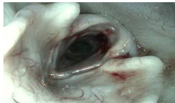
Figure 3. Endoscopic view of the respiratory tract after the foreign body was removed. Petechial hemorrhage foci are observed in the larynx cartilages.